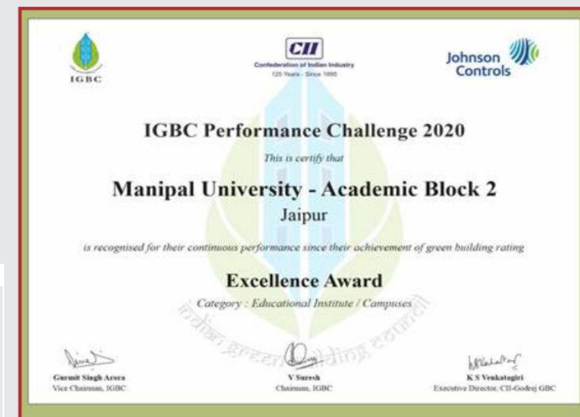
IGBC Performance Challenge 2020 for Green Built environment- Excellence Award'