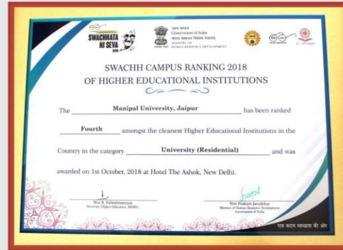
Ranked 4 th all over India in Swachhta Ranking 2018