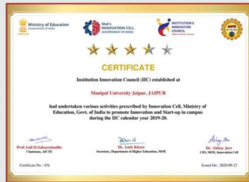
3.5 Star IIC Rating of MUJ for Academic Year 2019-20