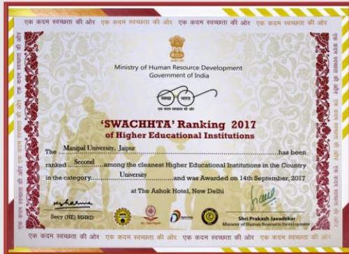
Ranked 2 nd all over India in Swachhta Ranking 2017