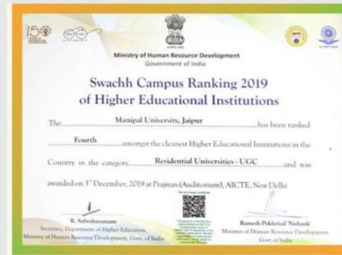
Ranked 4 th all over India in Swachhta Ranking 2019