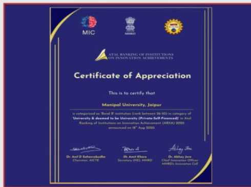
MUJ ARIIA Rankings 2020