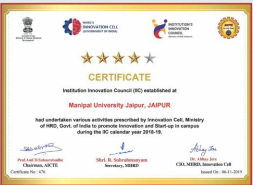
Outlook-ICARE Ranking 2020 THE BEST PROFESSION COLLEGES